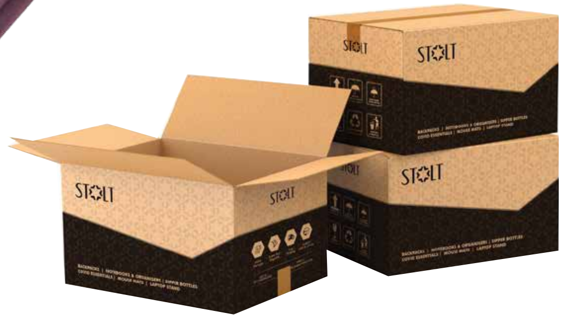
Carton Box For Bulk packaging